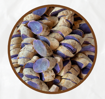
Okinawan Sweet Potato