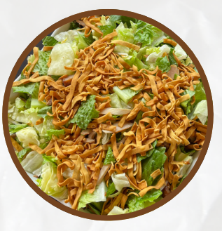
Chinese Chicken Salad